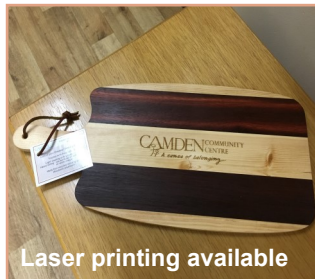
Laser printing available